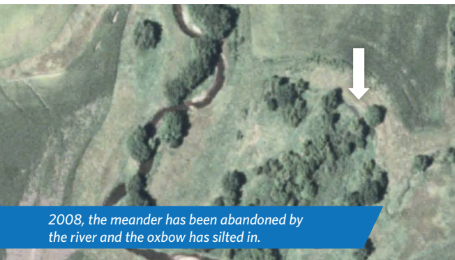
2008, the meander has been abandoned by the river and the oxbow has silted in.