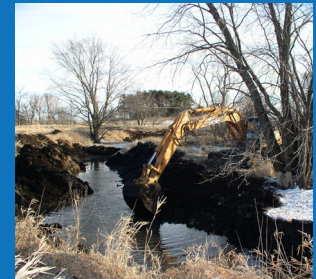
Oxbow during restoration