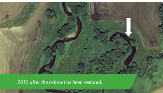
2013, after the oxbow has been restored.