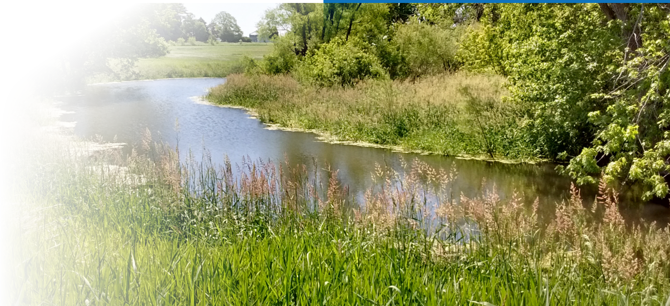
Oxbow after restoration