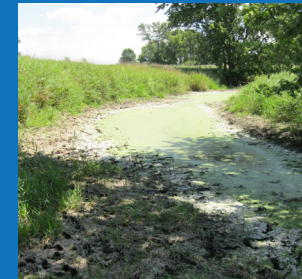
Oxbow before restoration